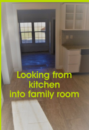
Looking from kitchen into family room