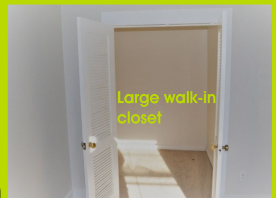
Large walk-in closet