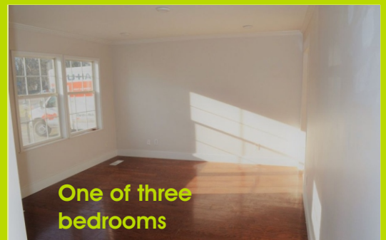
One of three bedrooms

Shown by appointment & one hour before sale